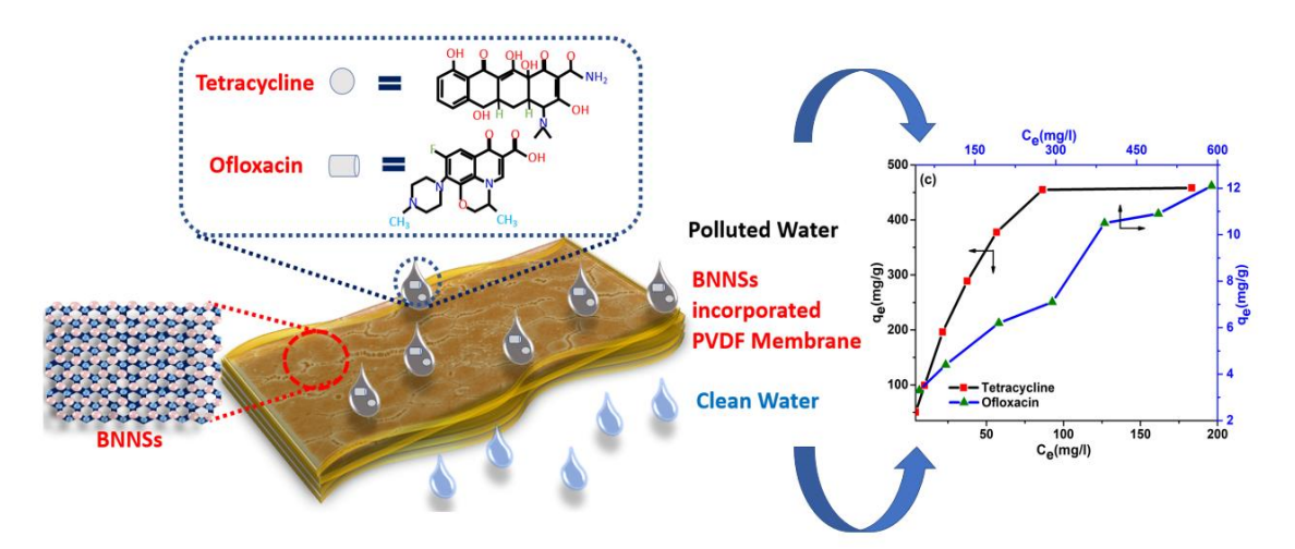
Figure #3: Nanomaterial-reinforced polymeric membranes for simultaneous removal of antibiotic contaminants from water.